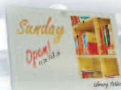
Final Examination Period

Main LIS Monday - Friday 8:30am. - 9:00pm. Saturday 8:30pm. - 5:30pm. Sunday and Public holidays closed